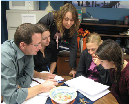
Members of the HousingPlus Research Team